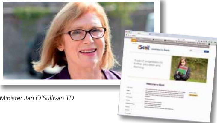
Minister Jan O'Sullivan TD