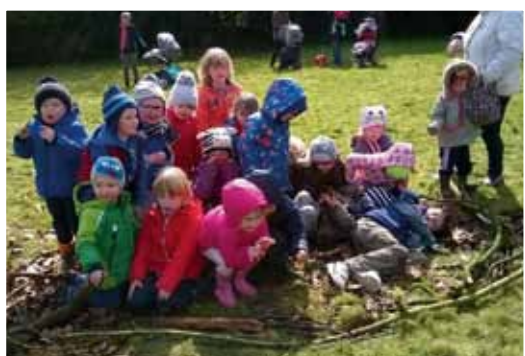
Ecology family fun day

Just Change is a community programme that works with different local community groups to facilitate positive, sustainable change within their area. Projects vary from installing rainwater harvesters to community gardens and Men's Sheds. We have previously run the Just Change Programme with community groups in Tipperary Town, Ballingarry and Mountmellick.